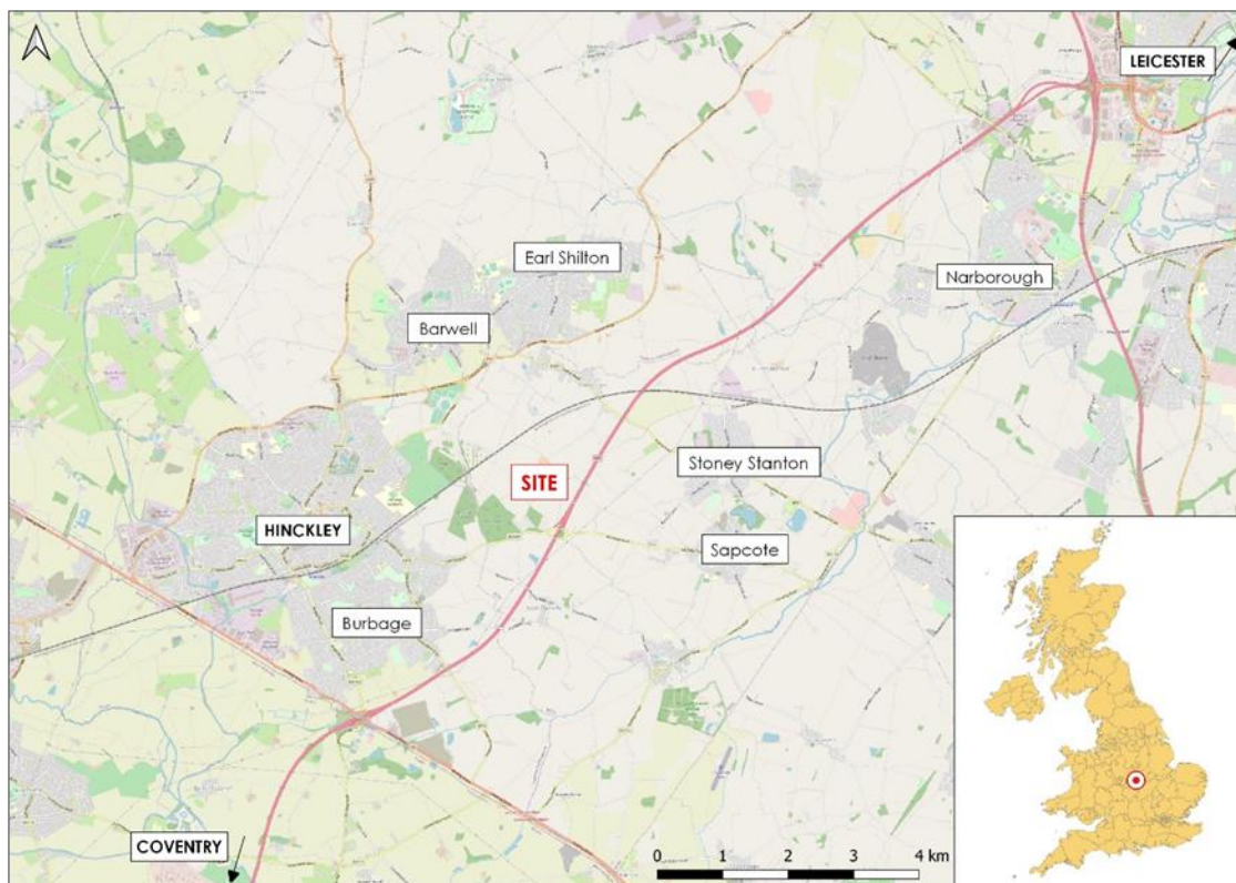
Figure 2: Urban Areas

Barwell and Earl Shilton to the north-east and Stoney Stanton and Sapcote to the east as shown in Figure 2.